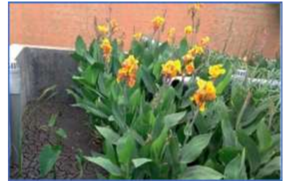
Figure 1 Planted Drying bed

3.Output: The findings of this study were presented at FSM 4 under the title "Characteristics of Faecal Sludge generated from Onsite Systems located in Devanahalli.